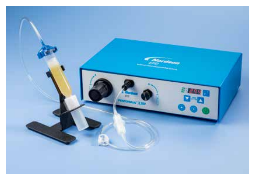
Performus X dispensers provide reliable dispensing for general applications in a wide range of industries.